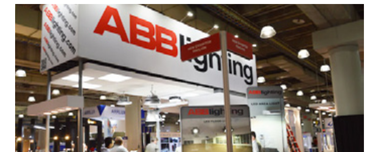
Light Fair NYC 2015